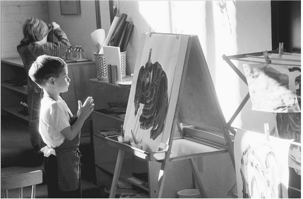
FIGURE 1.7. Montessori art: Child at easel

derful variety of creative illustrations in art, an area many people mistakenly think is not part of the Montessori curriculum (e.g., Stodolsky & Karlson, 1972; see the young artist in Figure 1.7). The same misconception is often found regarding music, although Montessori also has a full music curriculum. Not all Montessori teachers implement the full curriculum, sometimes because their training courses are of insufficient duration to cover it. Indeed, Dr. Montessori used two years to teach the Elementary curriculum to teachers, whereas the longest-running Elementary training courses today teach it in a year.