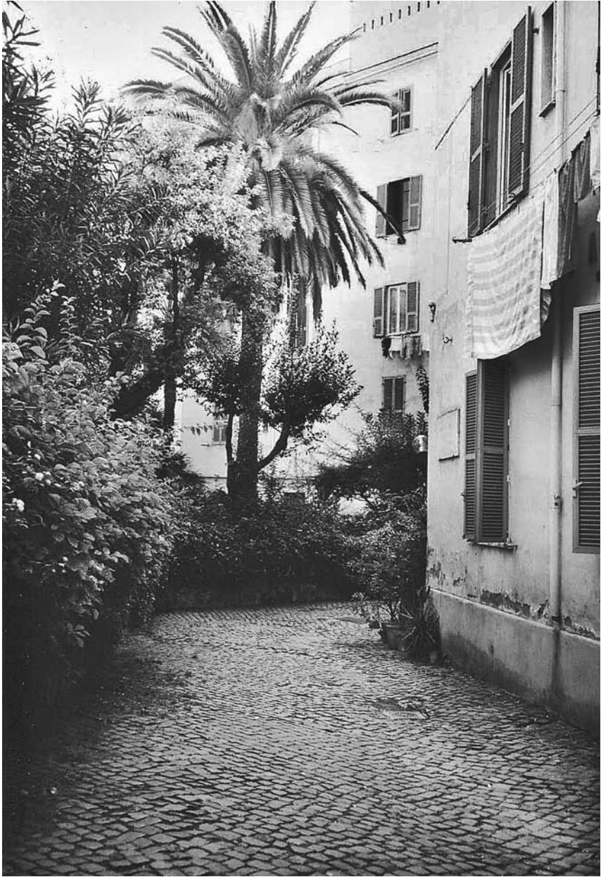
FIGURE 1.1. The Casa dei Bambini today at the original location, at 58 Via dei Marsi near the University of Rome.