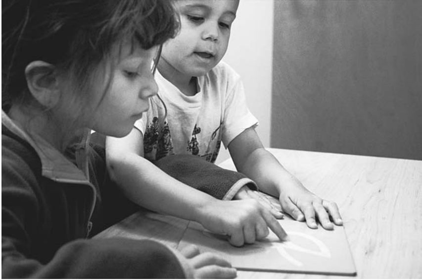
FIGURE 1.8. The Sandpaper Letters

trace the letters (shown in Figure 1.8), children learn to say the phonetic sound (not the name) associated with each letter. 3 Later, the Metal Inset and Sandpaper Letter activities come together. Children hold pencil to paper while making the same hand motions they made with the Sandpaper Letters, saying the sounds of the letters, and eventually stringing letters together to write words in cursive. This process is also assisted by the provision of the Movable Alphabet, a wooden box of cardboard letters that children use to make words (shown in Figure 4.4).