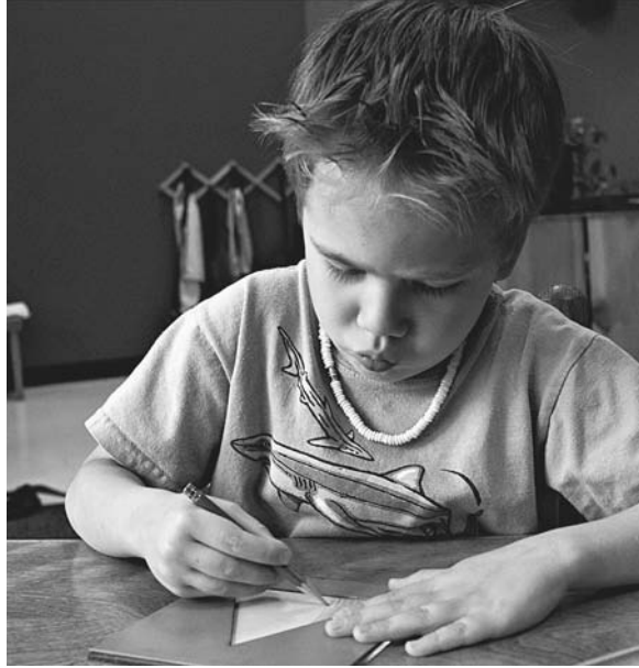
FIGURE 1.3. The Metal Insets

is a complex web of interrelationships with materials in different areas of the curriculum. As far as I know, no other single educational curriculum comes close to the Montessori curriculum in terms of its levels of depth, breadth, and interrelationship across time and topic.