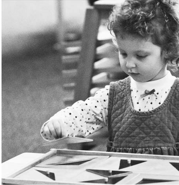
FIGURE 1.5. Triangle Tray from the Geometry Cabinet

wooden stick allows children to practice holding something pencil-like, but without the added concern of making marks that would damage the material. Children learn the names of various shapes of leaves while also (without knowing it) learning the wrist action and pencil grip for writing. Even prior to using the orange wooden stick, “The little hand which touches, feels, and knows how to follow a determined outline is preparing itself, without knowing it, for writing” (Montessori, 1914/1965, p. 96). Clear writing is exact, and such exercises prepare children by engaging them in precise movements.