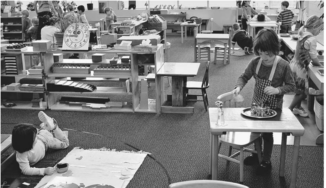
FIGURE 1.2. A Montessori classroom