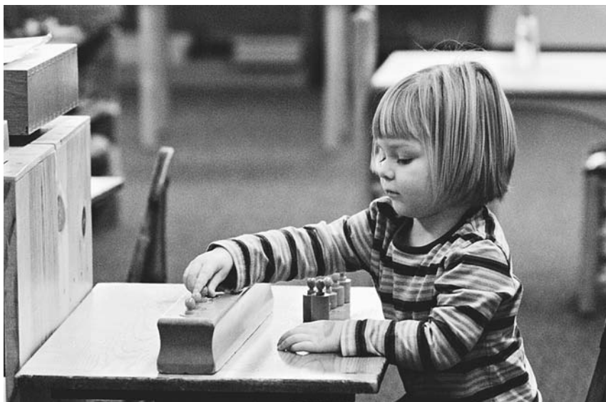
FIGURE 1.4. The Wooden Cylinders

both height and width together. The fourth decreases in width and increases in height. The exercise of lifting the cylinders out, mixing them up, and then returning them to their appropriate holes was designed primarily to educate the child's intelligence by engaging the child in an activity requiring that he or she observe, compare, reason, and decide (Montessori, 1914/1965). Focusing on dimension with this exercise also prepares the child for math, and the work enhances the child's powers of observation and concentration. But the addition of the knobs allowed the material to confer two additional benefits geared toward writing: strengthening the finger and thumb muscles and developing the coordination needed for holding a pencil.